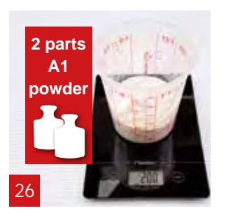
Weigh 2 parts of A1 powder. In this example we used 200 g A1 powder.