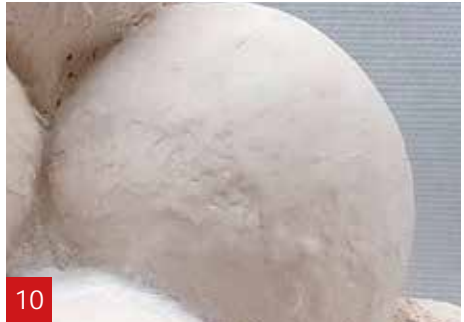
Resulting in a smooth finish.