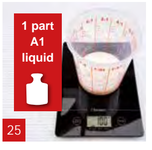
Weigh 1 part of A1 liquid. In this example we used 100 g A1 liquid.