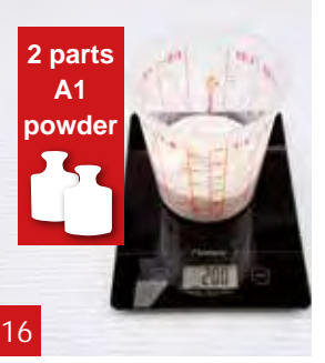
Weigh 2 parts of A1 powder. In this example we use 200 g A1 powder.