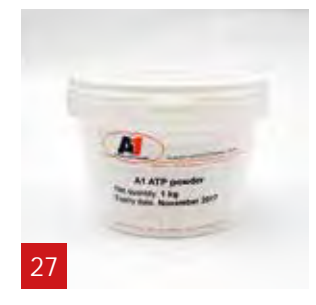
In this example we use ATP powder.