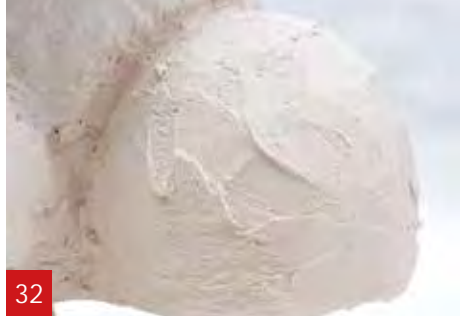
Resulting in a smooth finish. For an even more smooth finish (after \pm 20 min.) use the sanding techniques (see option 2; nr. 11-12-13).