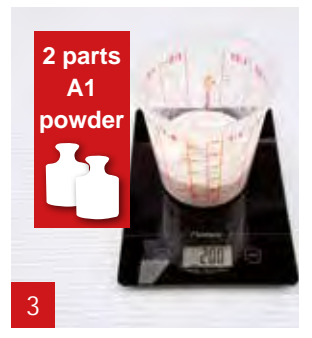
Weigh 2 parts of A1 powder. In this example we use 200 g A1 powder.