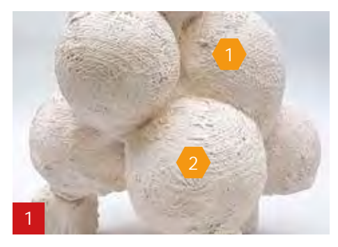
How to create a smooth finish on your object.