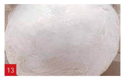
Resulting in an even more smooth finish.