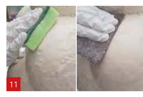
For an even more smooth finish you can use (after \pm 20 minutes) a damp sponge or a waterproof sanding pad.