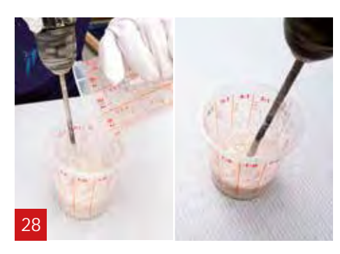
Gently add the A1 powder to the A1 liquid. Stir the mixer till all lumps have disappeared (± 1 min.) resulting in a smooth material.