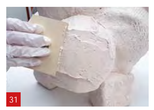
The A1 'paste or putty' can be applied on an object with a spatula.