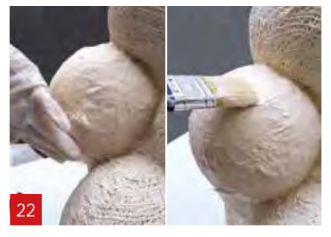
The C-veil must be covered with a layer of A1 by hand or brush.