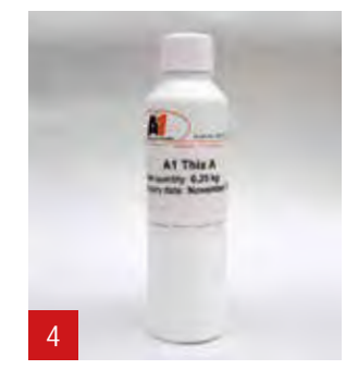
Add 2% Thix A (of the total quantity) to the A1 liquid (in this example we use 6 g).