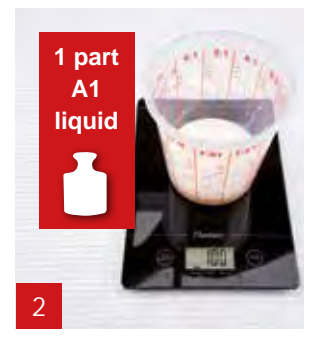
Weigh 1 part of A1 liquid. In this example we use 100 g A1 liquid.