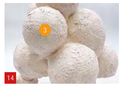
How to create a smooth finish on your object.