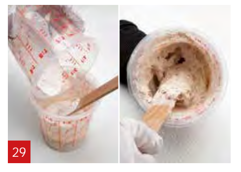
Add as much ATP powder as needed into the A1. Stir firmly till all lumps have disappeared.