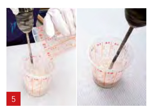
Gently add the A1 powder to the A1 liquid. Stir the mixer till all lumps have disappeared (± 1 min.) resulting in a smooth material.