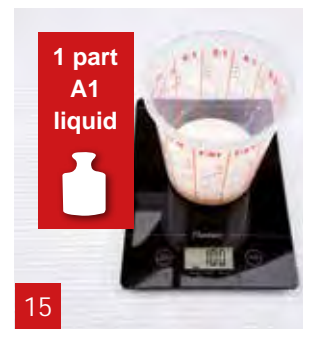
Weigh 1 part of A1 liquid. In this example we use 100 g A1 liquid.

Gently add the A1 powder to the A1 liquid. Stir the mixer till all lumps have disappeared (± 1 min.) resulting in a smooth material.