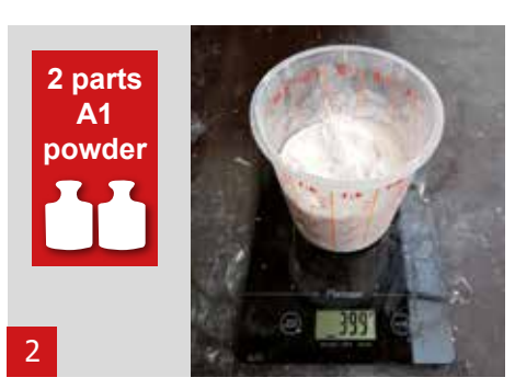
Weigh 2 parts of A1 powder. In this example we use 400 g A1 powder.