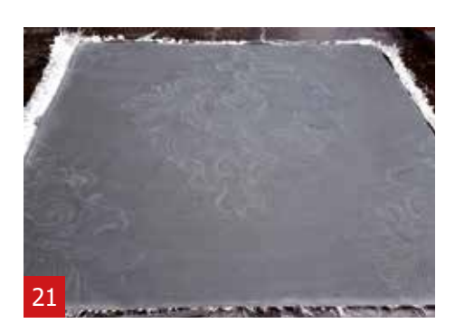
The result is an exact copy of the mould.