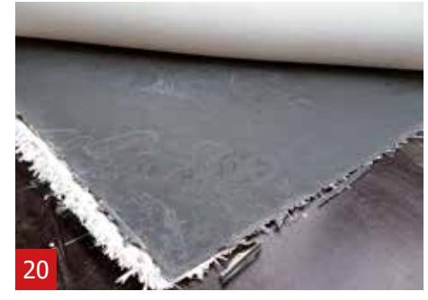
Strip the mould from the surface.