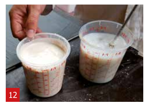
Directly clean the mixer in water.