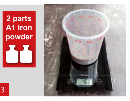
Weigh 2 parts of A1 iron powder. In this example we use 400 g iron powder.