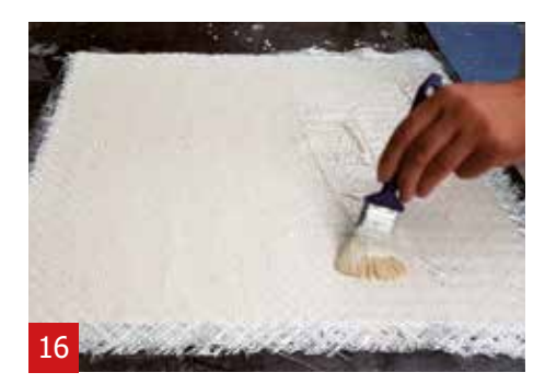
...and devide it equally on the surface.