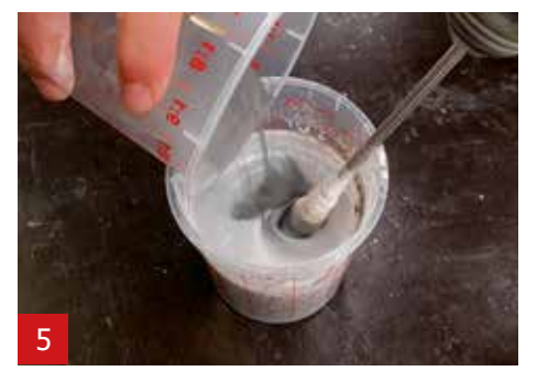
Add the A1 iron powder to the A1 and stir for 1 minute.