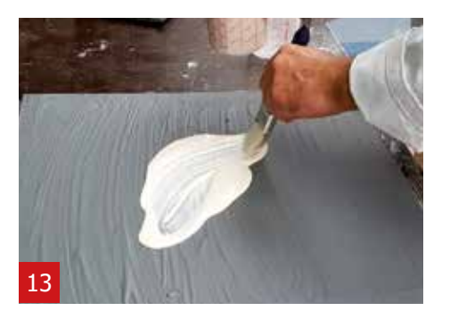
Apply a thin layer of A1 with a brush on the surface.