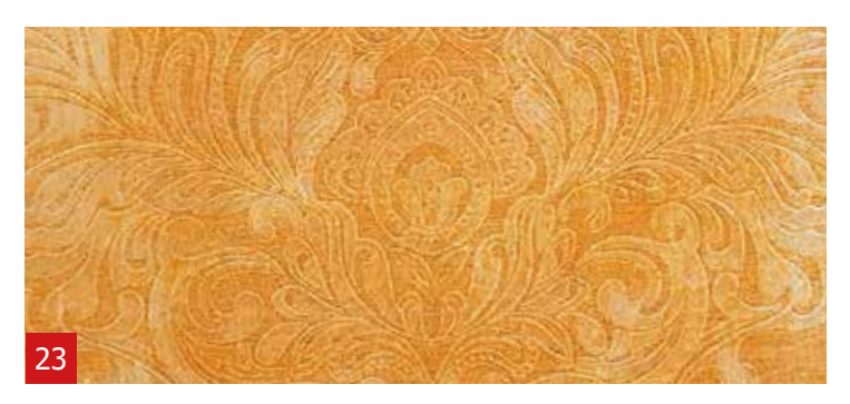
The final result is a rusty effect. If you want to stop the iron-proces close the surface of the panel with a sealer.