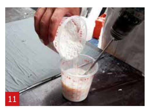
Again add the A1 powder to the A1 liquid and mix for 1 minute.