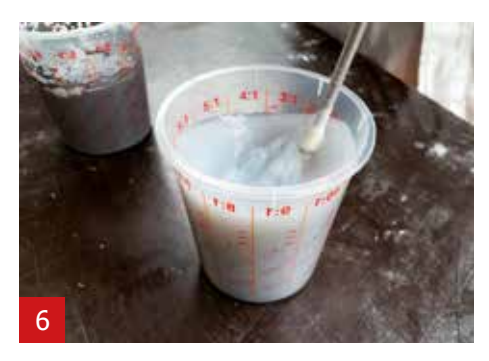
Clean the mixer directly after use in water.