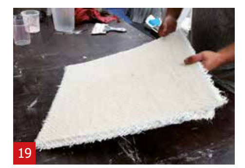
Carefully turn the mould around.

Before demoulding let the mould dry for \pm 1 hour.