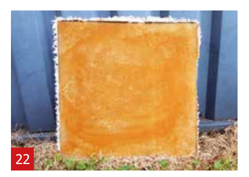
Place the panel outside to let it rust. For a more intens iron-look place the panel outside for a longer time. It's also possible to use chemicals to speed up the proces.