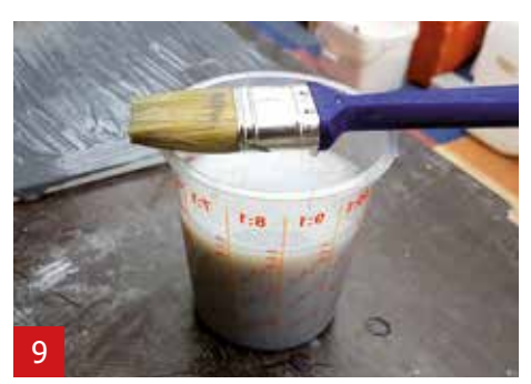
Clean the brush directly after applying the first layer.

The surface must reach a thickness of 1 to 2 mm. Curing time of A1 is \pm 20 minutes.