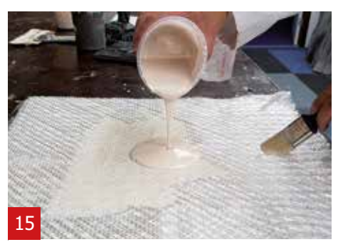
Apply another layer of A1 on the triaxial fibre...

Apply a piece of triaxial fibre with the same size as the object on the surface and smoothen it with a brush from the center.