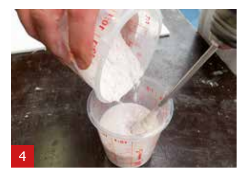
Add the A1 powder slowly to the A1 liquid and stir with the mixer until you have a smooth surface.