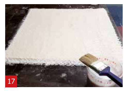
Repeat step 14, 15 and 16 twice without pausing. Then clean the brush with water.