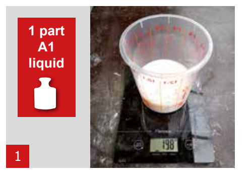
Weigh 1 part of A1 liquid. In this example we use 200 g A1 liquid.